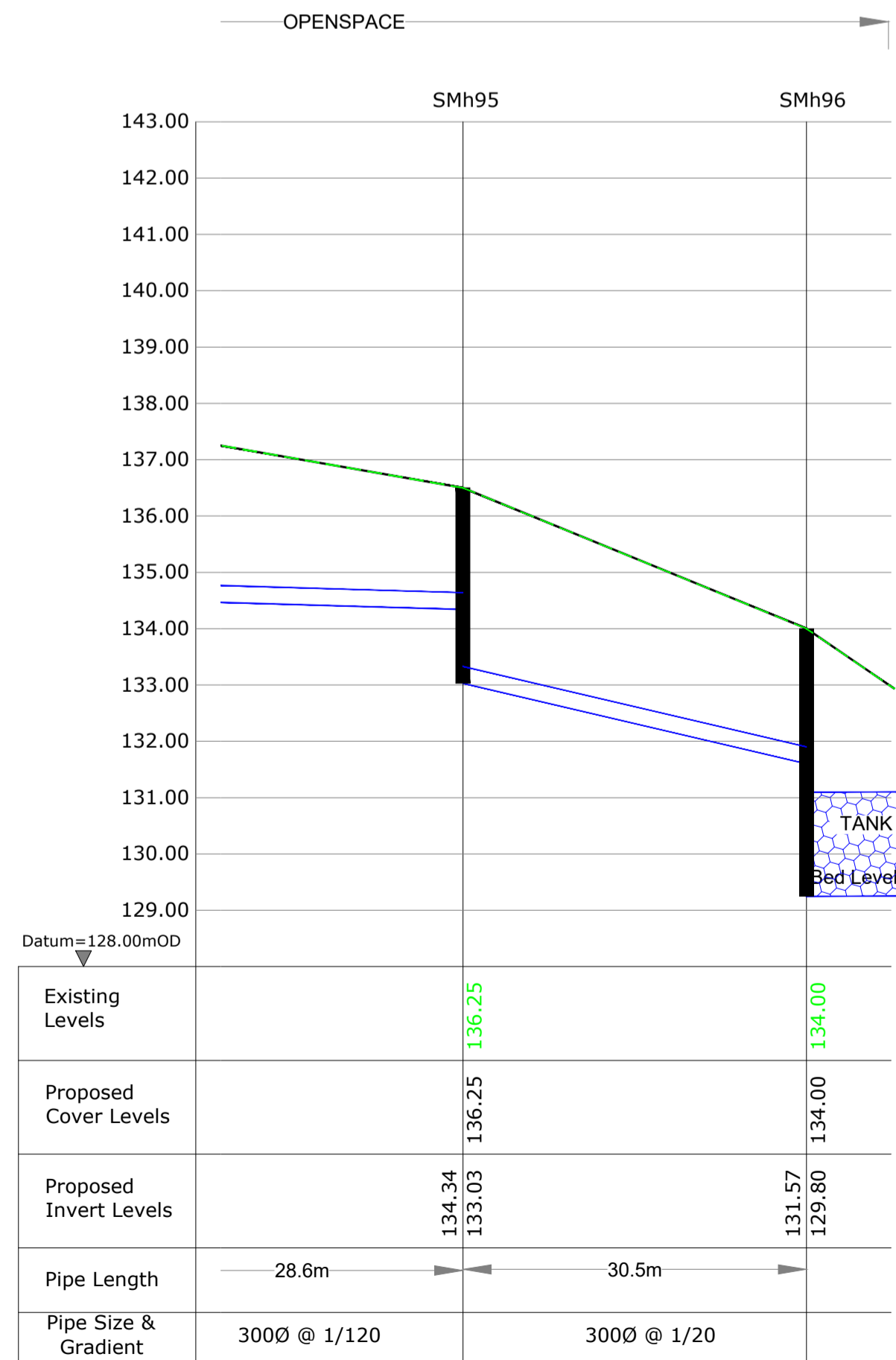
S/W Longitudinal Section SMh95 to Tank 1 Vertical Scale 1:100 Horizontal Scale 1:500